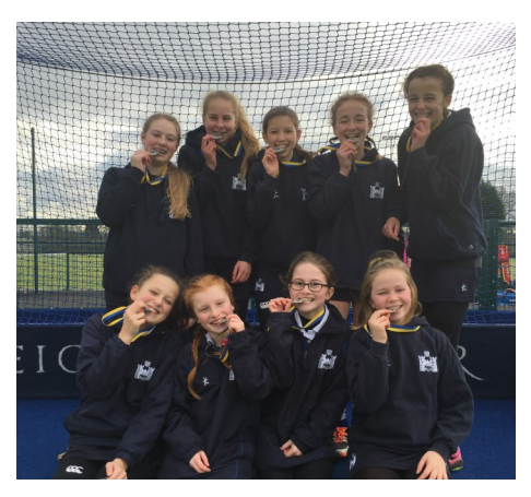
The UI3B girls who were runners up in the Surrey Trophy